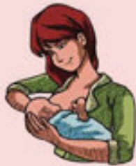
Cross Cradle Hold